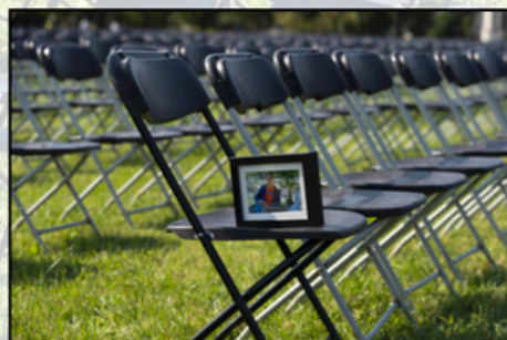
Empty chairs arranged for the First National Covid-19 Day of Mourning on Oct. 4, 2020

Para participar, simplemente llene la forma escaneando el código QR, elija su fecha y hora de misa, e invite a su familia para asistir a la Misa. El nombre de su difunto será mencionado en nuestras peticiones por las víctimas del Covid.