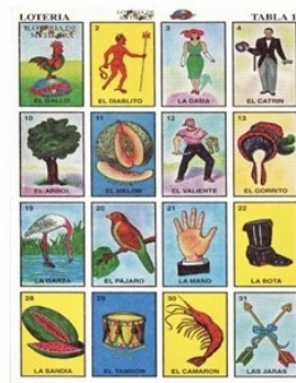
$10 para jugar

Estaremos en el estacionamiento de la escuela.