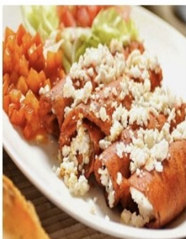
$10 por Orden

*Entretenimiento: Un juego de Loteria al principio de cada hora.