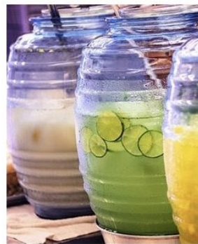
$2 por vaso de 16oz.