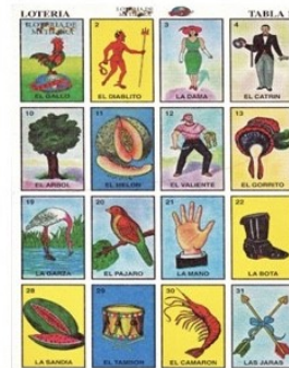
$10 to Play

We will be located at the School Parking Lot.