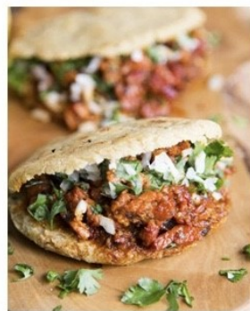
$10 por Orden