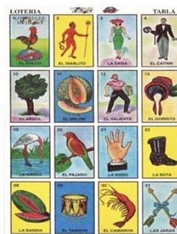
$10 to Play

We will be located at the School Parking Lot.