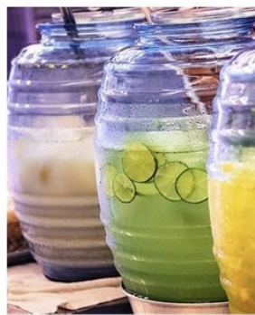
$2 for 16 oz. Cup