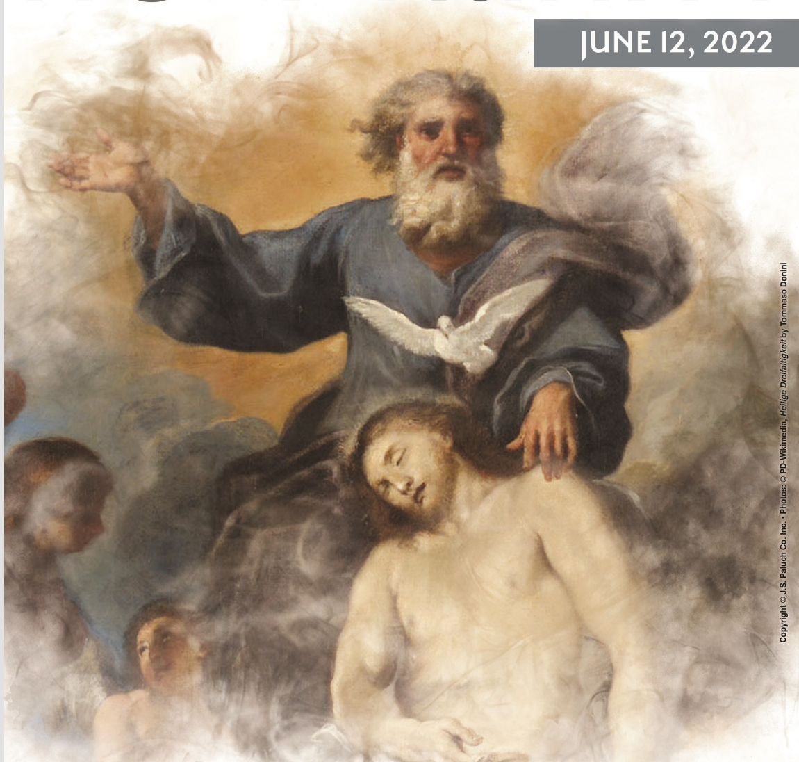
Copyright © J.S. Paluch Co., Inc. - Photos: © PD-Wikimedia, Heilige Dreifaltigkeit by Tommaso Donini

O Lord our God, how wonderful your name in all the earth!