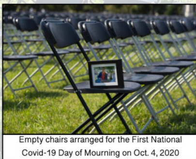
Empty chairs arranged for the First National Covid-19 Day of Mourning on Oct. 4, 2020

Para participar, simplemente llene la forma escaneando el código QR, elija su fecha y hora de misa, e invite a su familia para asistir a la Misa. El nombre de su difunto será mencionado en nuestras peticiones por las víctimas del Covid.